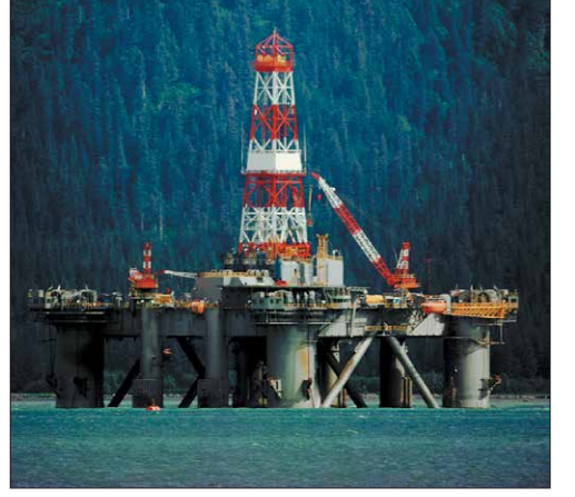
The EHW hot water pressure washer is ideal for mining and drilling operations where an open flame for heating is prohibited.